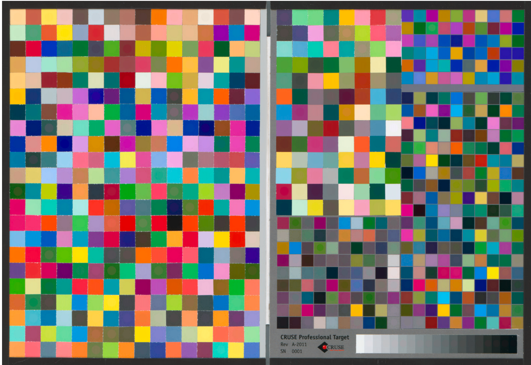
Round dots: Target colors (measured), Configuration: Osram 954 tubes, BG 40 filter, new scan box (G+ box), Cruse Professional Profile