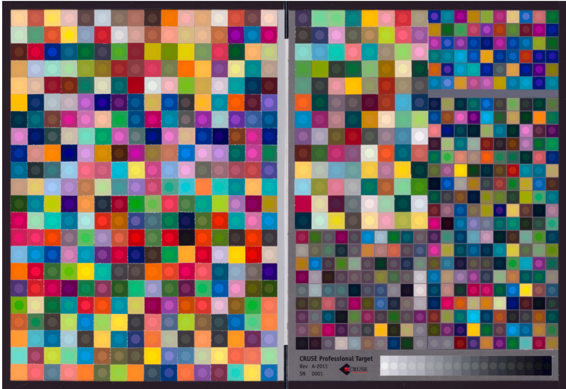
Round dots: Target colors (measured), Configuration: Osram 954, B&W 489 filter, old scan box, basic profile (ProfileMaker profile made with ColorChecker SG)